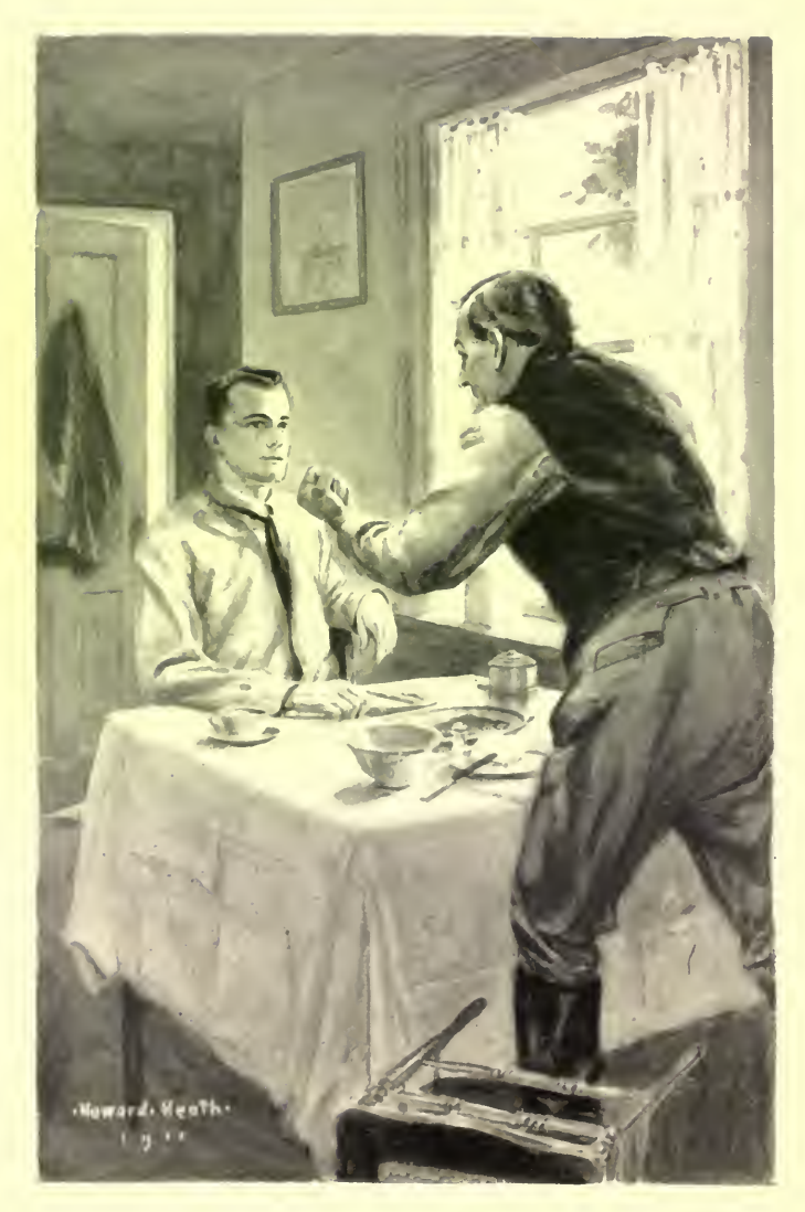
""Who said I'd done anything? It's a lie."" [Page 44.]